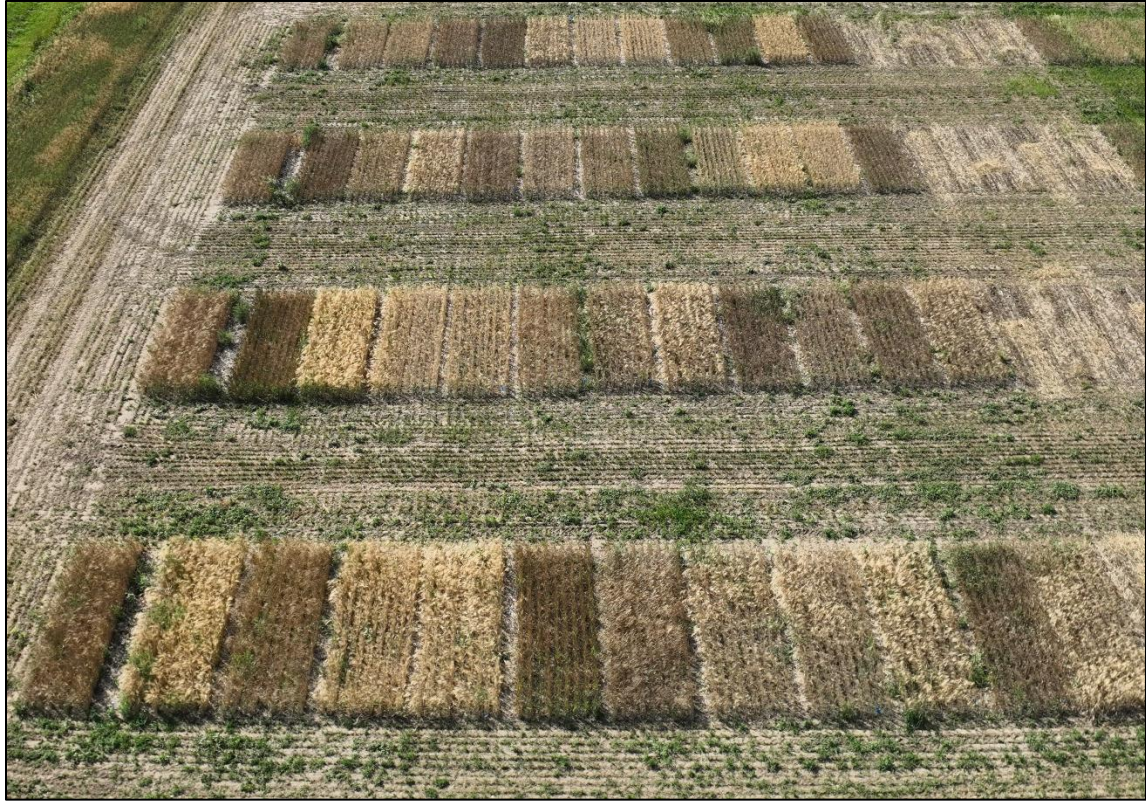
Figure 1. “Demonstration of the regional impact of varietal traits and flowering timing in spring wheat (CWRS) and durum (CWAD)” was set up as a replicated small split plot design as shown here in Swift Current.