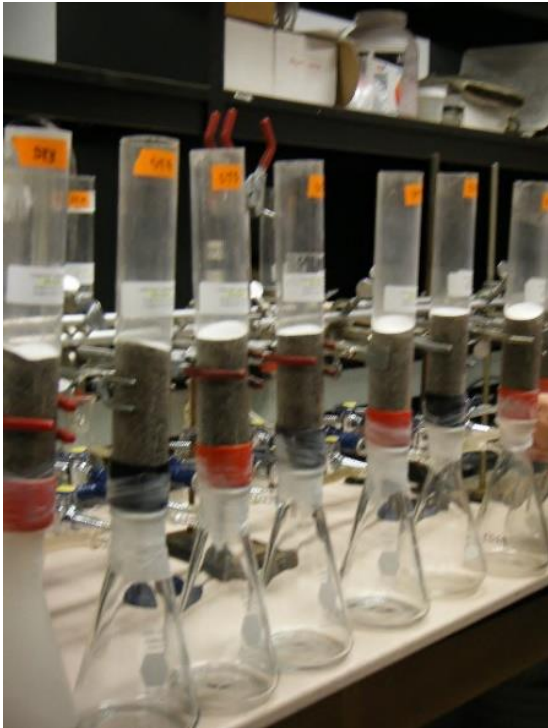
Figure 1. Incubation vessels constructed from a clear polypropylene tube. Glass microfiber pads were Whatman 30 micron mesh, 1.6 \mu m glass microfiber filters (GF/A- Circles 55mm) cut both to properly fit the tube. The apparatus was held together with cyanoacrylate glue.

were pre-leached with 200 mL of 0.01 M CaCl followed by 10 mL of a N-free nutrient solution (Fig. 1). Leachate was analyzed for inorganic N. Moisture contents were adjusted to approximate field capacity and samples were incubated for 16 weeks, with similar extractions occurring every two weeks.